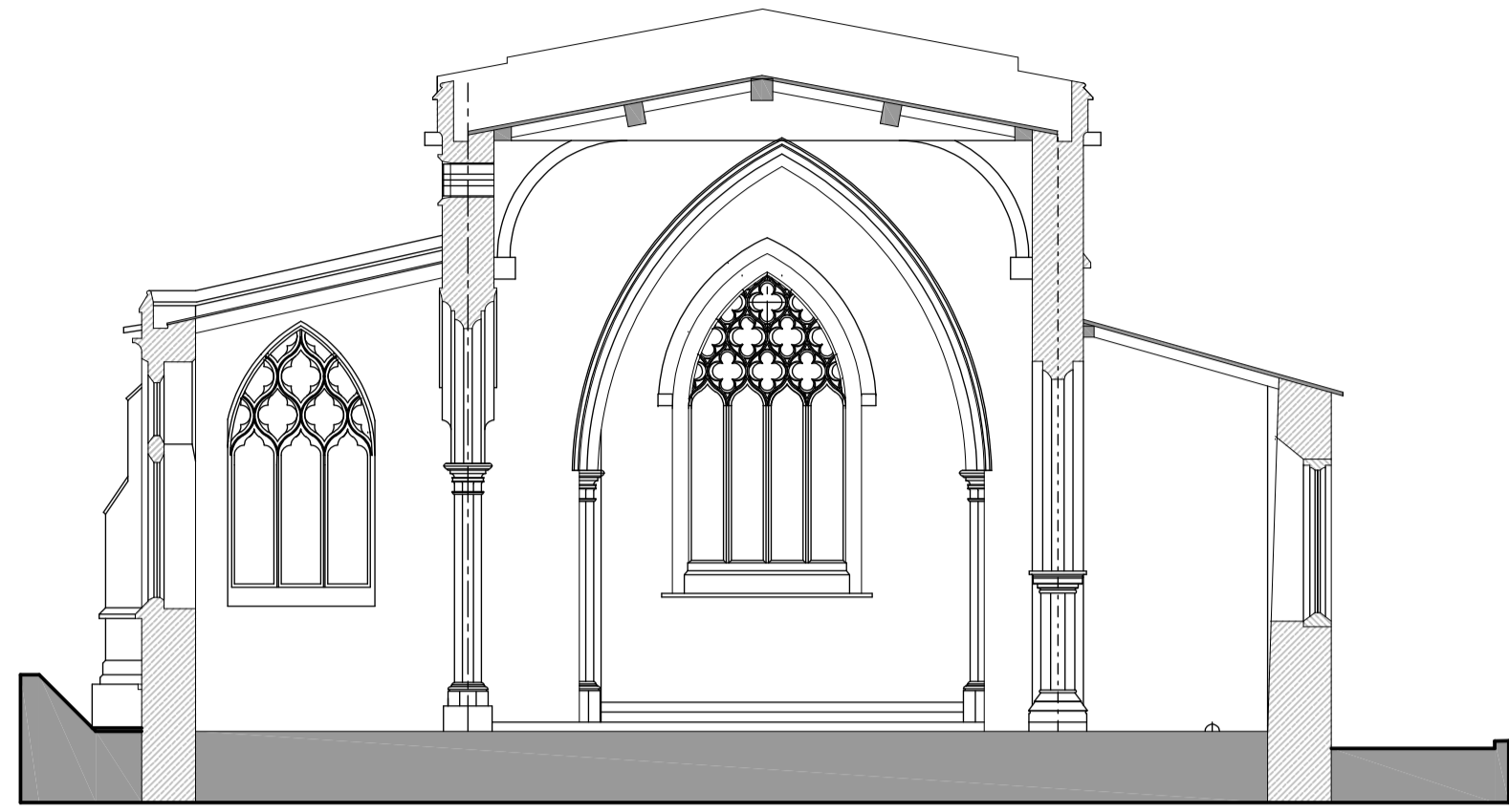
Section C, looking East through Nave 1:100