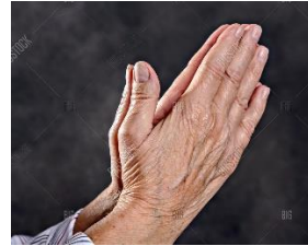
Personal Prayer Tips