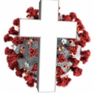
Praying about Coronavirus

General Coronavirus guidance from the Church of England.